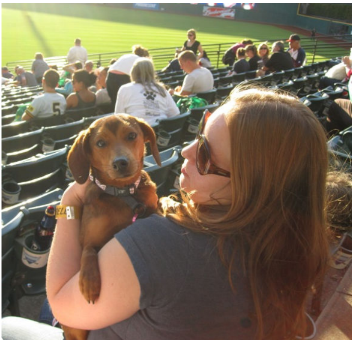
The Indians welcomed 267 dogs and 461 humans to Puppypalooza, a fund-raiser for the Cleveland APL on Aug. 26.

Tuesday, Oct. 5 - E-mail will go out to volunteers detailing opportunities available at Fur Ball 2010.